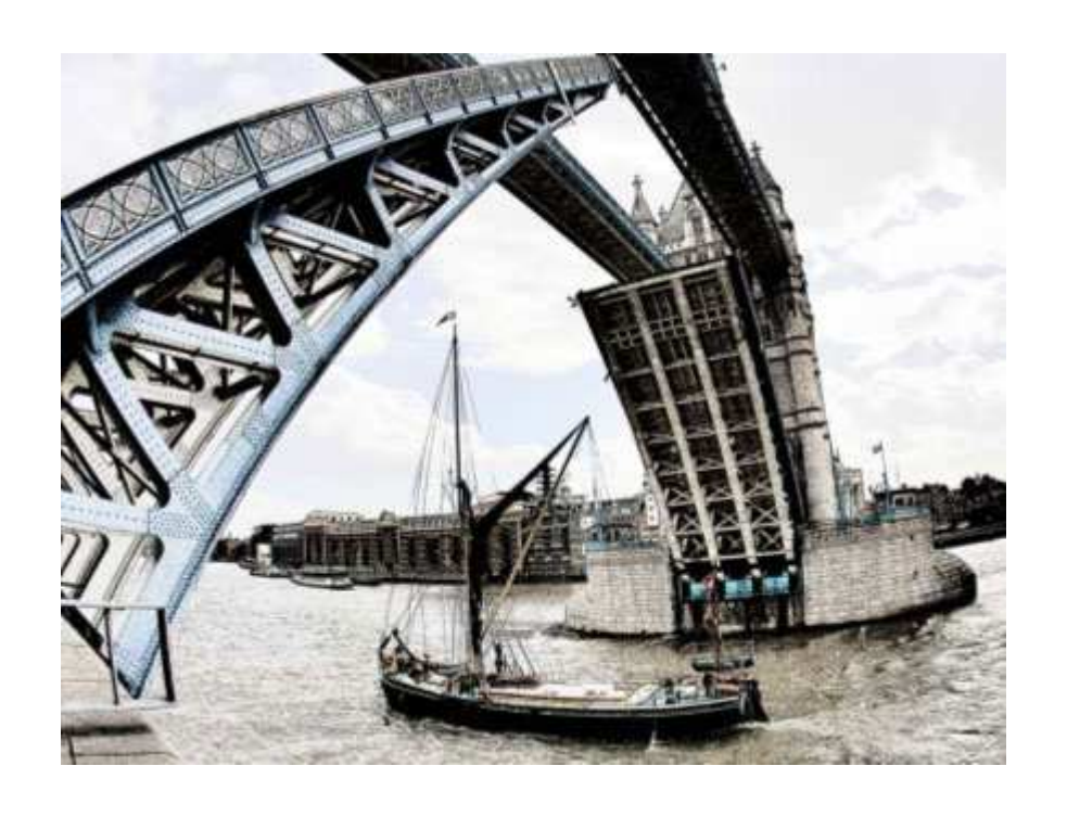
Tower Bridge/London, England/Photographic Time Line